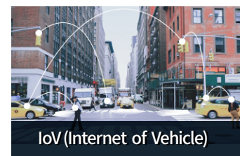
IoV (Internet of Vehicle)